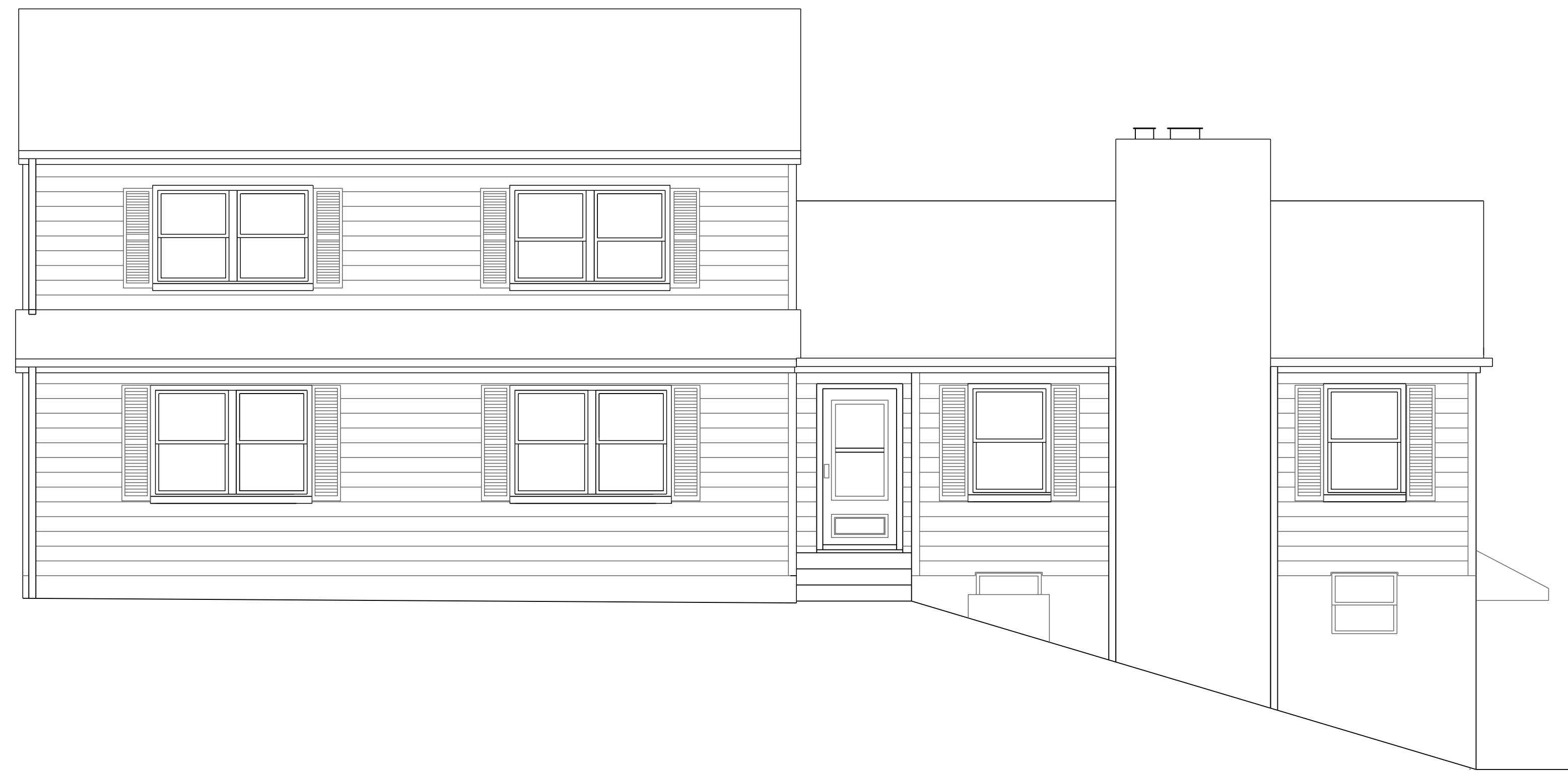
1 A-3 EXISTING SOUTH ELEVATION SCALE: 1/4" = 1'-0"