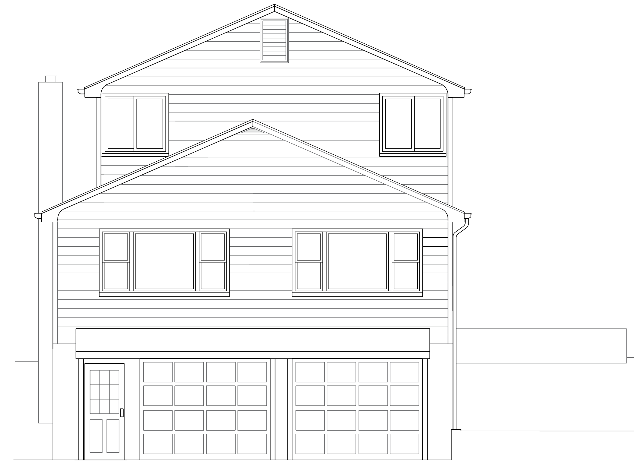
2 A-2 EXISTING EAST ELEVATION SCALE: 1/4" = 1'-0"