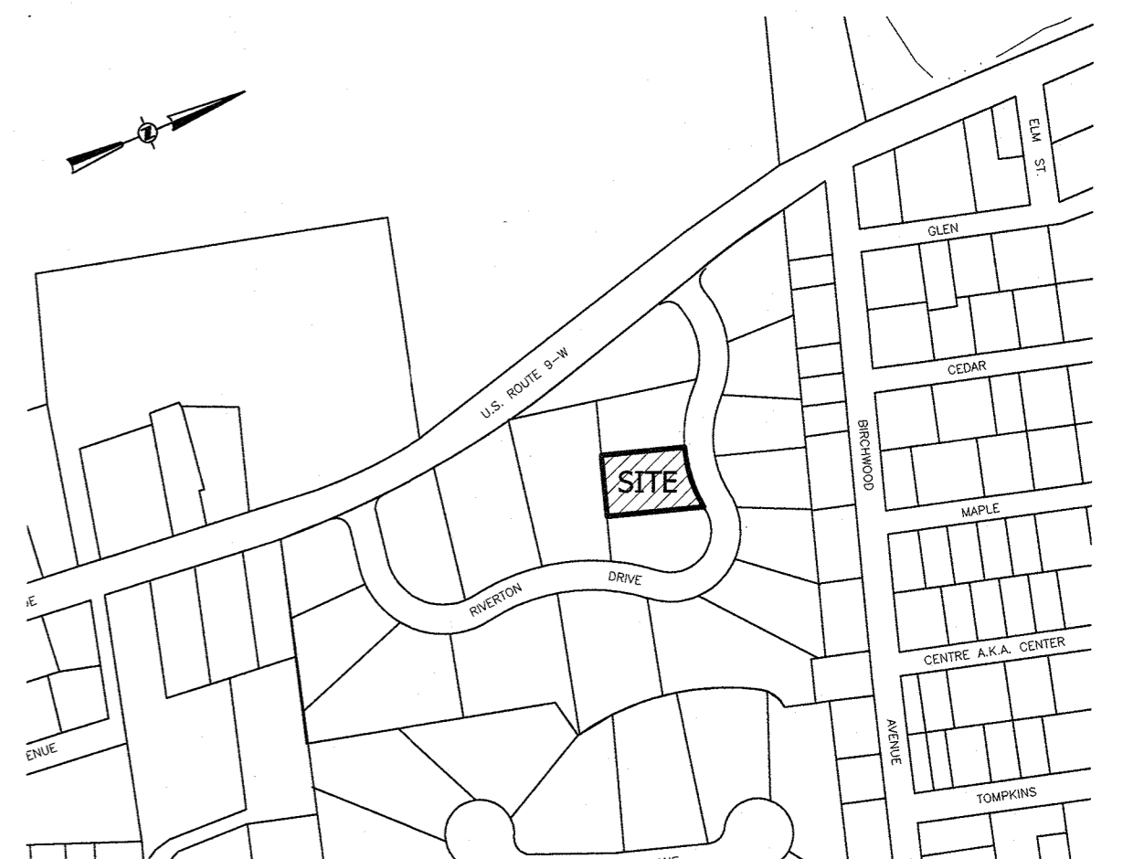
VICINITY MAP SCALE : 1 IN = 300 FEET