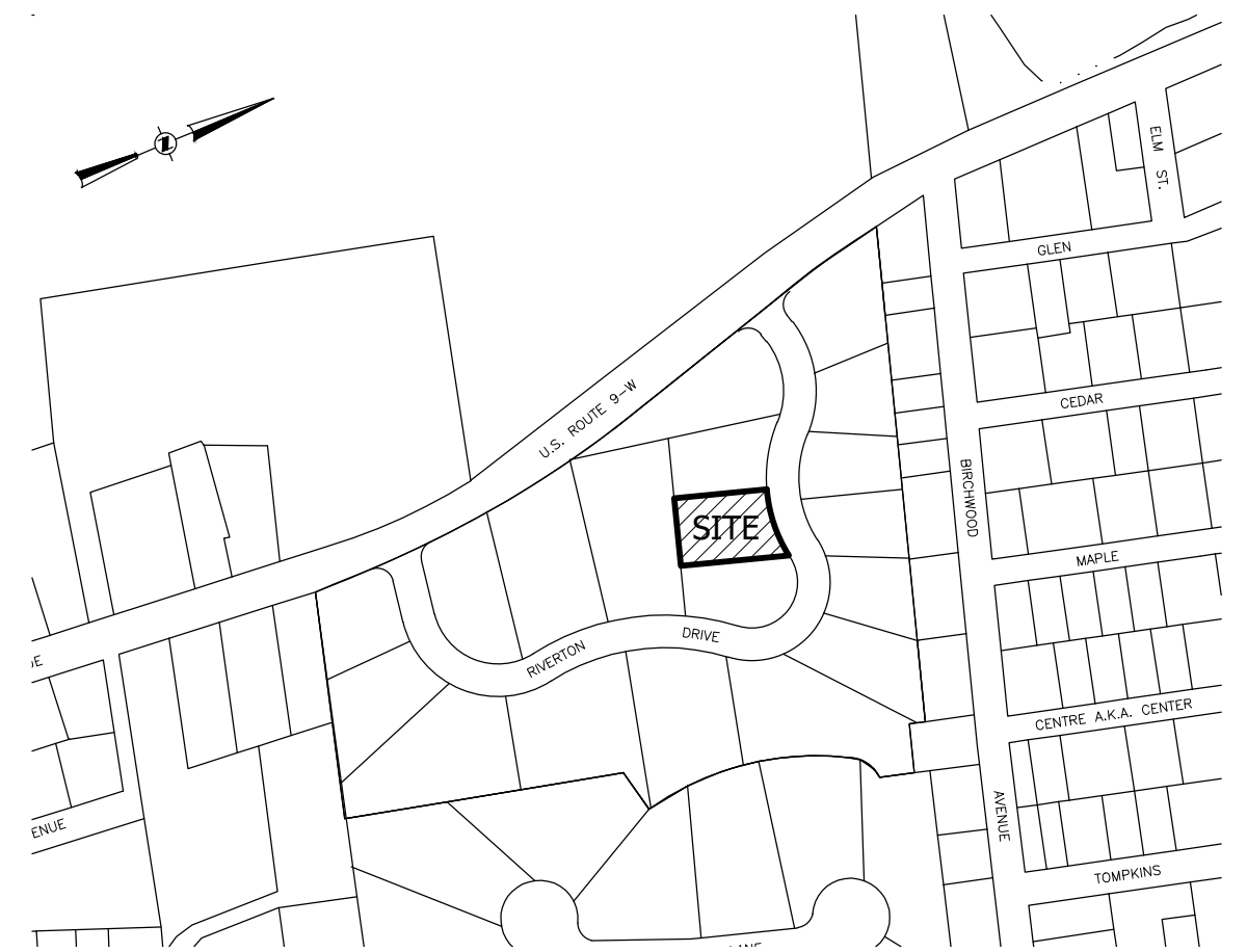
VICINITY MAP SCALE : 1 IN = 300 FEET

IMPROVEMENTS CONSTRUCTED AT TIME OF C.O.