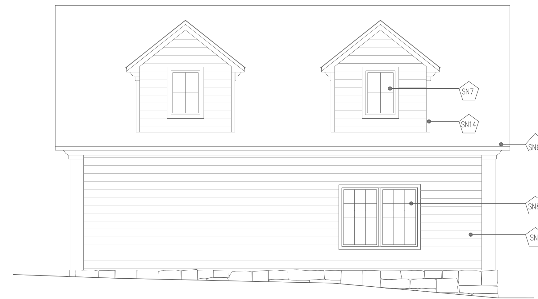
3 - WEST ELEVATION SCALE: 1/4" = 1'-0"

REICH RESIDENCE ADDRESS: 530 NORTH BROADWAY NYACK, NY 10960 NY