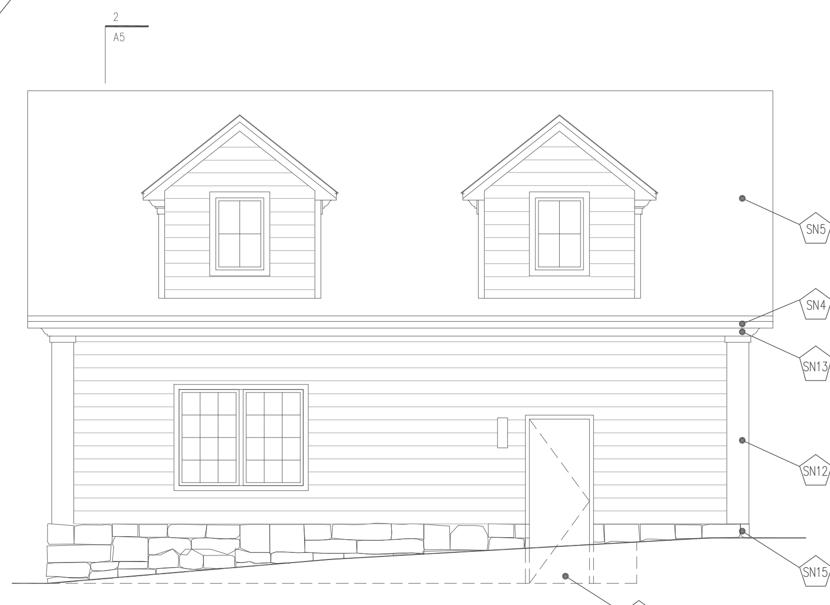
2 - EAST ELEVATION SCALE: 1/4" = 1'-0"