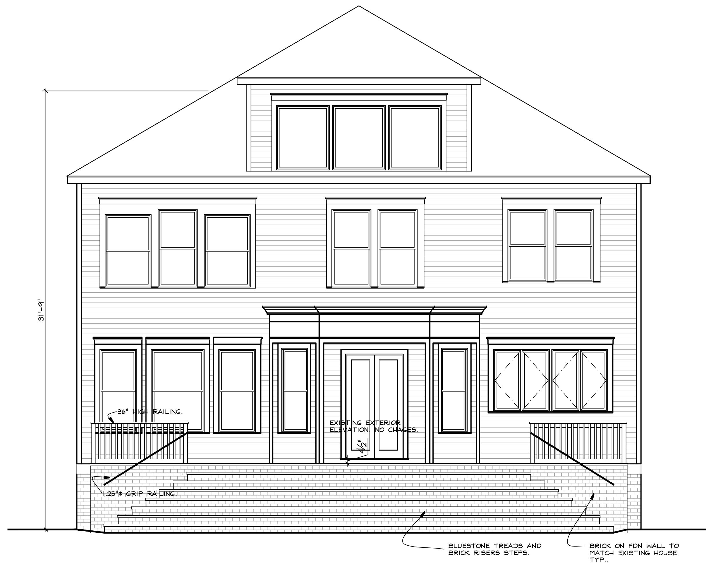
2 REAR ELEVATION AI 1/4" = 1 FOOT