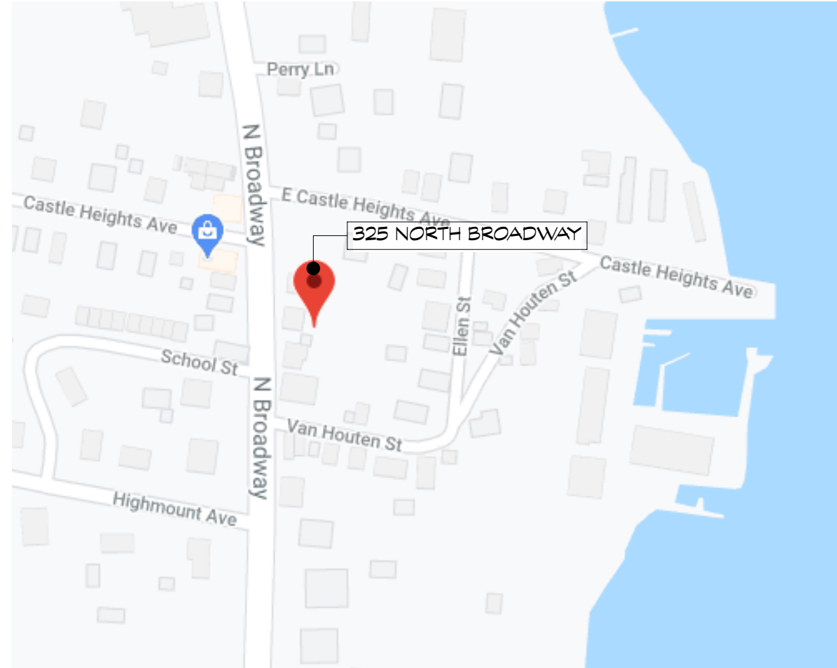
3 VICINITY MAP SCALE: 1" = 300'

* denotes an existing nonconformity proposed not to be made worse † denotes variance required