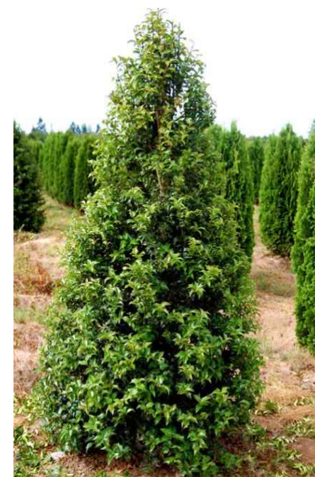
Ilex aquiperny 'Dragon Lady'