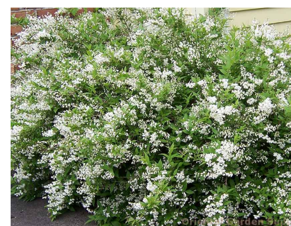
Deutzia gracilis 'Nikko'