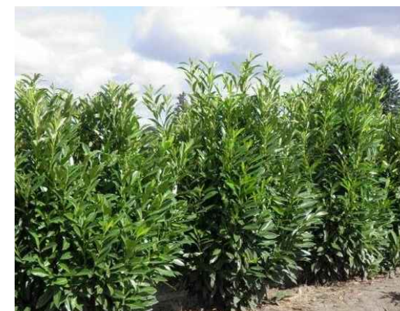
Prunus laurocerasus 'Schipkaensis'