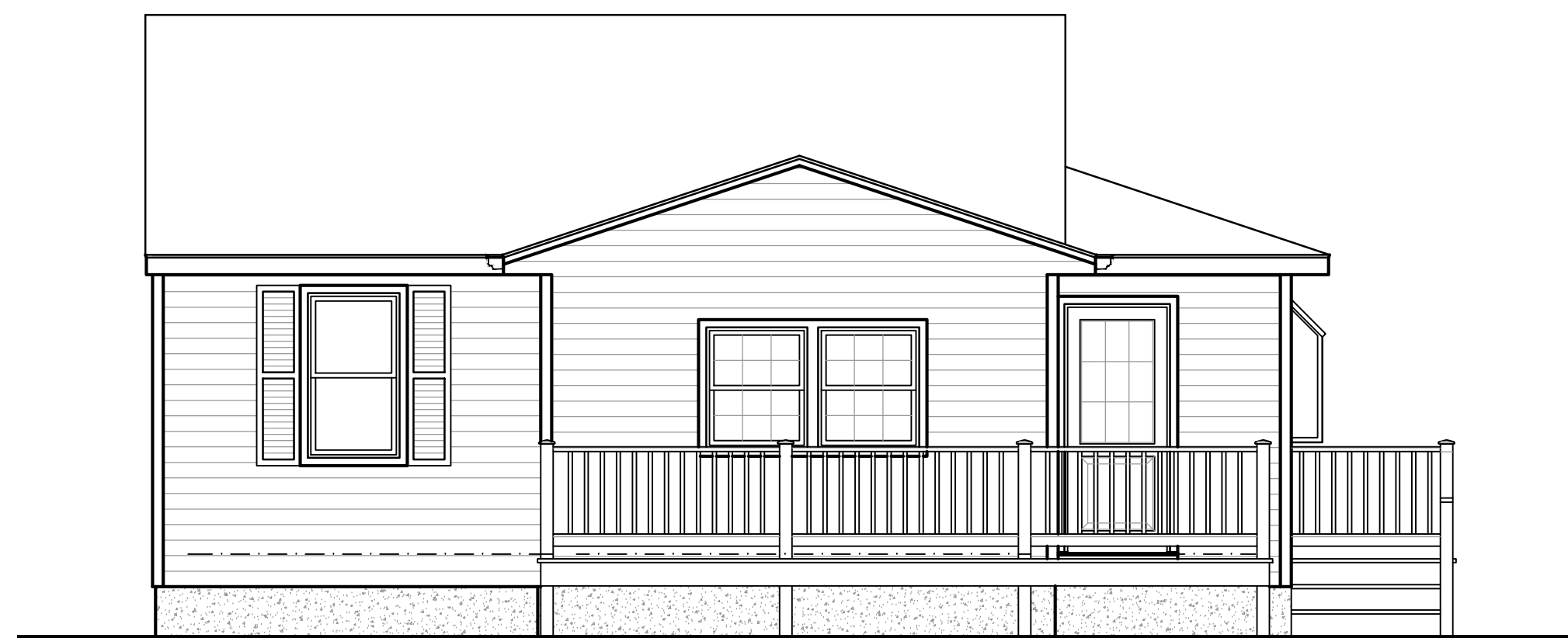
3 FRONT ELEVATION A2 1/4" = 1 FOOT