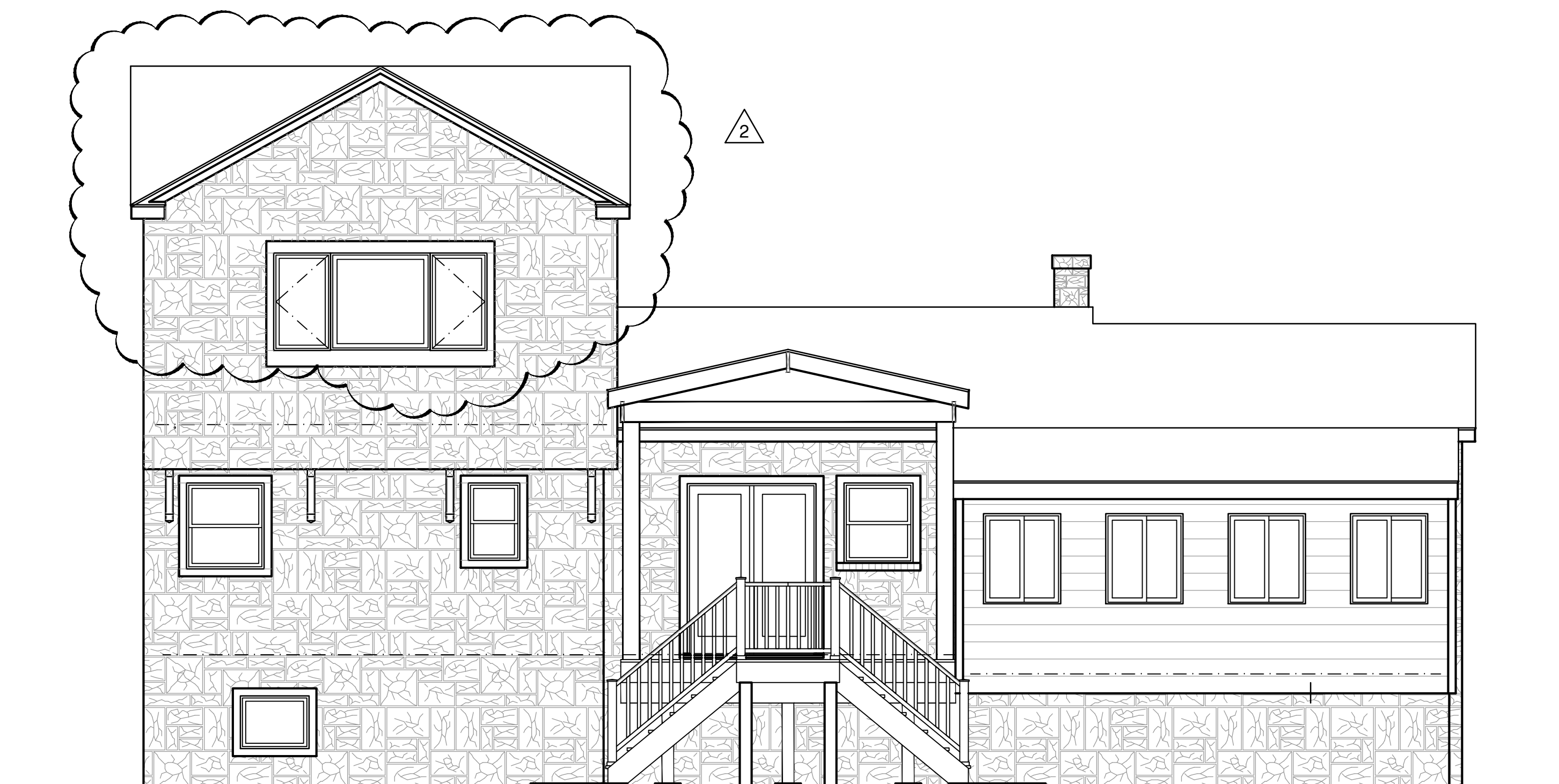
① EAST ELEVATION A3 1/4" = 1 FOOT