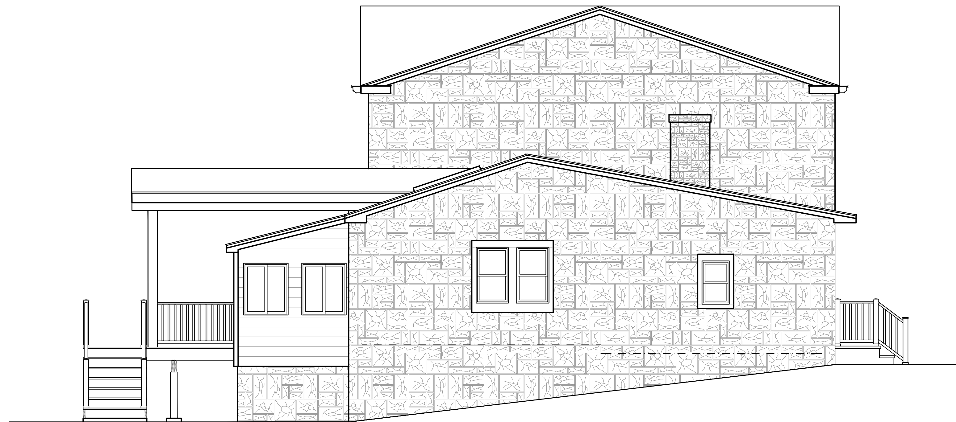
② NORTH ELEVATION A3 1/4" = 1 FOOT