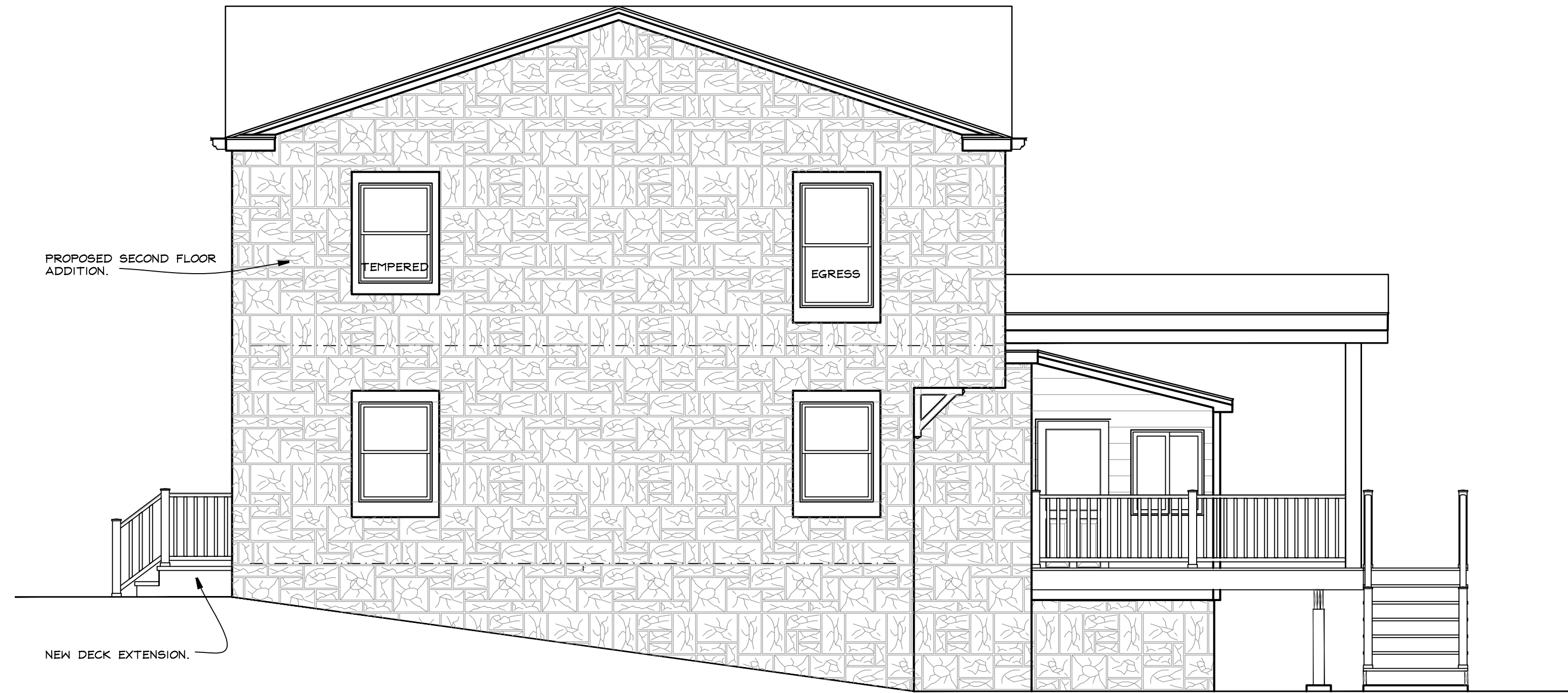
② SOUTH ELEVATION A2 1/4" = 1 FOOT