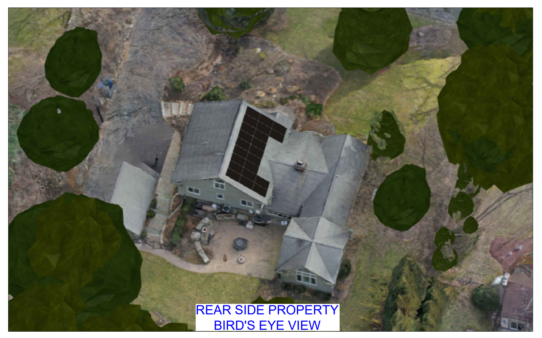
Page 2 of 2