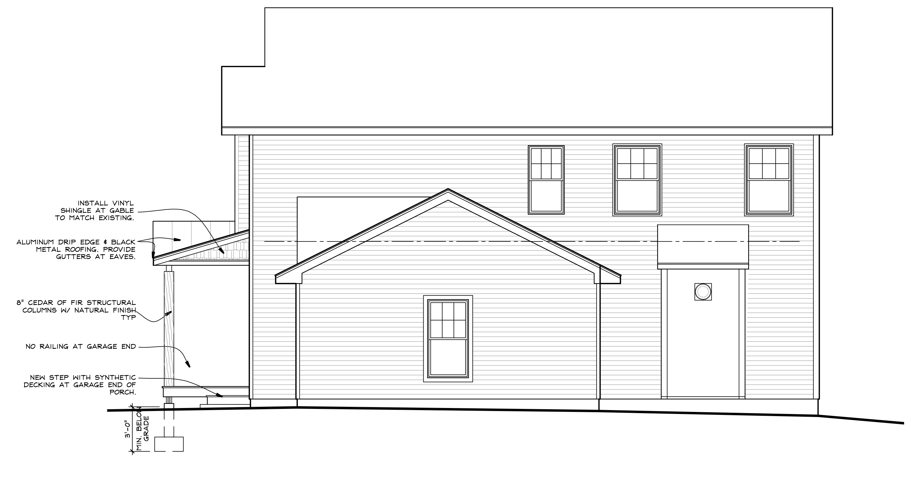
(B) EAST SIDE ELEVATION A3 1/4" = 1 FOOT