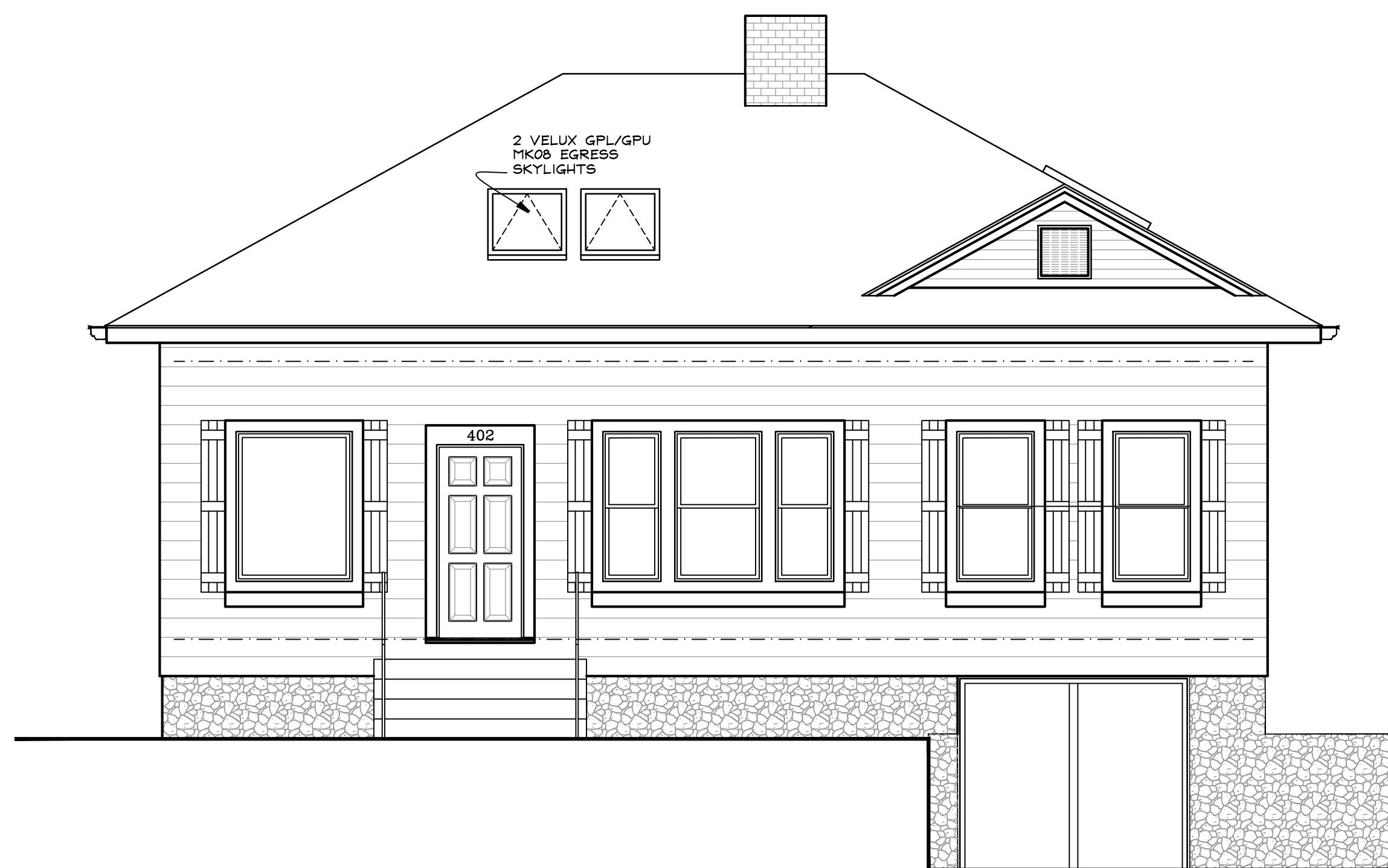
1 FRONT ELEVATION A3 1/4" = 1 FOOT