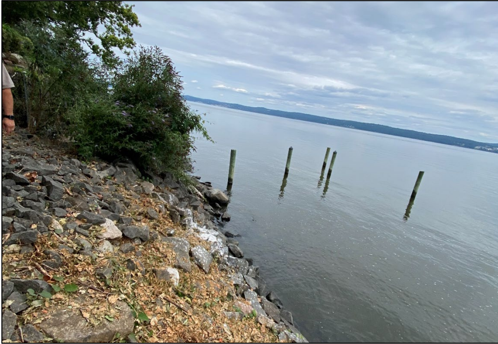
Figure 2: Existing shoreline and waterfront structures – Facing north.